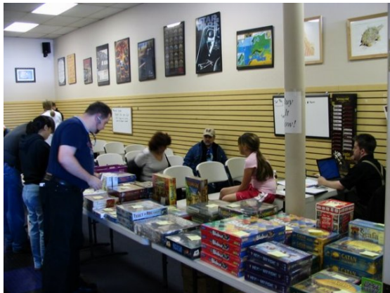
Ding & Dent Auction

Mini-Cons . Check coming months for our mini conventions, when we'll feature a themed event such as board games, war games, or role-playing games. We're always looking for volunteers to run a game at these events, so let us know if you're interested.