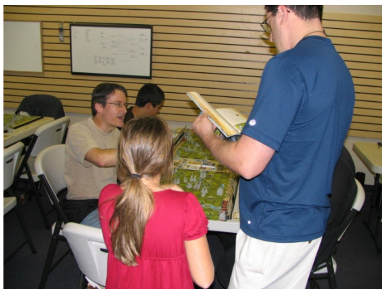
Board game mini-con 2007