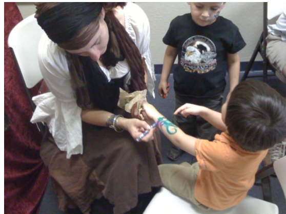
Face painting at 2008 Anniversary Party