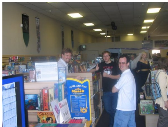
2007 Anniversary Party